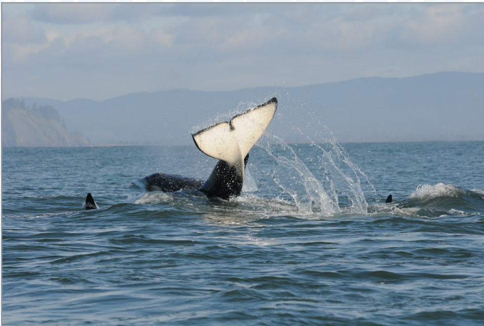
Photographed during Winter 2015 killer whale research survey to better understand different sources of salmon prey.

NOAA Fisheries also consults under Section 7 of the ESA with other federal agencies on issues such as operations of dams, recommending changes to make them safer for fish. These improvements are now well underway throughout the Columbia River Basin, which is home to one of the largest endangered species recovery programs in the country.