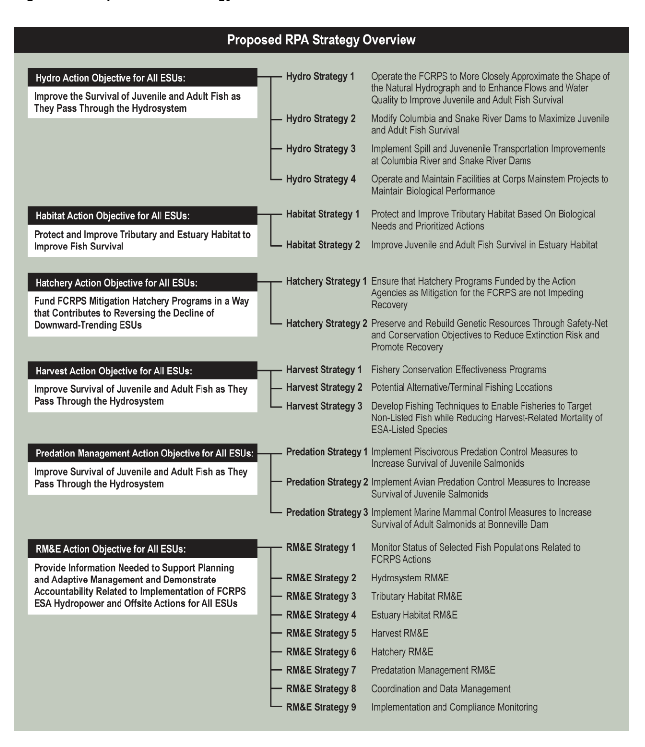
Figure 2-1. Proposed RPA Strategy Overview